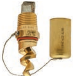
N FM & UL Approved Full Cone Spiral