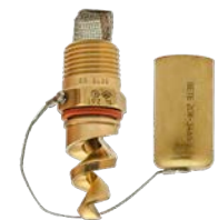
N3, N3W, N4, N4W, N5, N5W US Coast Guard 46CFR