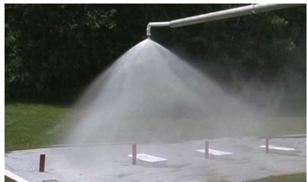
Outdoor test of wind drift effect on fire protection nozzles' spray coverage.