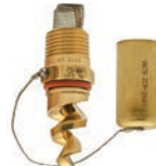
N FM & UL Approved Full Cone Spiral