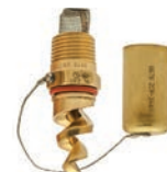
N FM & UL Approved Full Cone Spiral