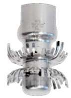
HydroClaw® Stationary Max. Range 10 ft/3 m