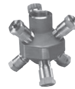
CLUMP Stationary Max. Range 10 ft/3 m