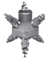
LEM Stationary Max. Range 8 ft/2.4 m