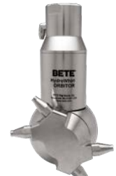
HydroWhirl® Orbitor Controlled Rotation Max. Range 130 ft/39.6 m

Note: The maximum cleaning range listed for each nozzle is tank diameter.