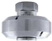
HydroWhirl® Disc Free-Spinning Max. Range 11 ft/3.6 m